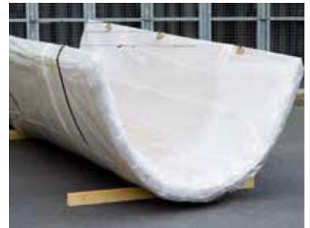
U-shaped bale ready for shipment